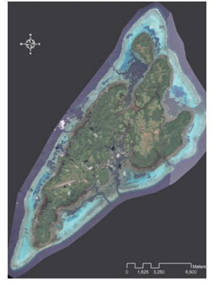
Fig. 2 Yap Proper Island and its coral reef from Satellite

With an Environmental Vulnerability Index score of 392, the FSM is