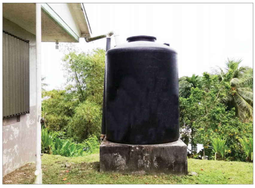
Fig. 4 A modern current type of for rainwater roof collection and storage

Despite the uncertainty that exists in relation to the magnitude of climate change impacts, what is evident is that traditional agriculture in Yap is facing, and will continue to face, in the coming years from climate change [5]. Yap's sustainable food production system- traditional agroforestry system - is dominated by agroforestry system and taro patches [6]. Most subsistence crops are grown along the coastal plains. Taro patches (Figure 3) along the coastal plains and atoll settings are especially vulnerable to sea level rise, storm surges and saltwater intrusion that are already occurring and observations and market data suggest