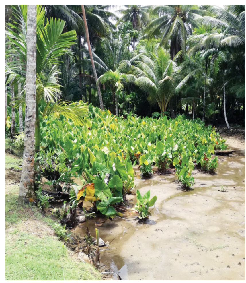
Fig. 3 Traditional taro patches in Yap. Taro is a traditional local staple food crop, its root are largely cooked in the villages

The FSM runs a large trade deficit, with imports being around ten times larger than exports. Food and fuel represent a significant proportion of this, comprising 46.6% of total imports to the FSM in 2007. The