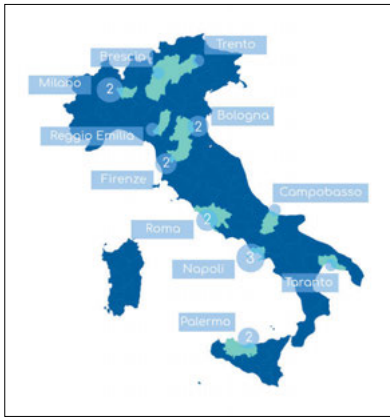
Fig.1 Italian cities of registration of the 18 migrants' associations admitted to the A.MI.CO training courses 2018