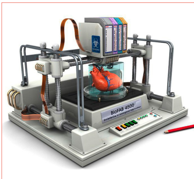
FIGURE 3 Bioprinting Challenges. The major challenge for 3D-bioprinting is to build up functional human entire organs, such as heart, in order to replace allograft transplantation avoiding waiting list Source: "Bioprinting toward organ fabrication: challenges and future trends", IEEE Trans Biomed Eng , 60, 691-699, 2013

Biomimicry involves the manufacturing of identical reproductions of the cellular and extracellular components of a tissue or organ. The replication of biological tissues on the microscale is necessary for this approach to succeed. Thus, understanding of the microenvironment, as well as the nature of the biological forces in the microenvironment, is needed [2].