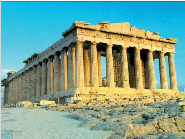
FIGURE 2 The Parthenon view from North-East