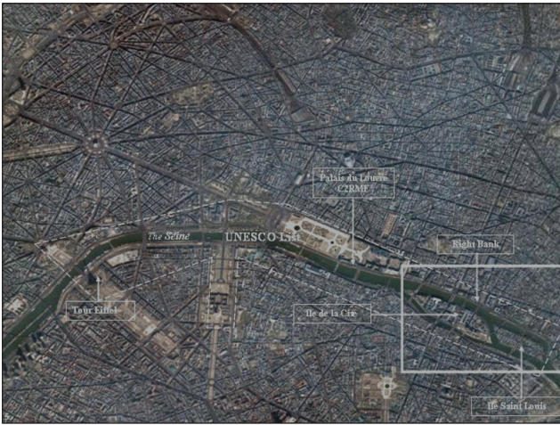
FIGURE 4 Satellite view of the centre of Paris

XVII and XVIII centuries, Haussmannian buildings (end of XIX century), as well as important monuments like Notre Dame and Sainte Chapelle, dating from the Middle Ages. Quays and bridges were not taken into account in this evaluation.