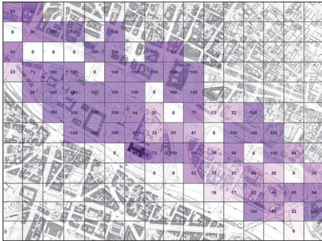
FIGURE 5 Geographical distribution of the percentage of limestone in the façades of buildings and monuments of the studied area, on a grid with cells of 100 m x 100 m (floor mean height=3m)

(estimated): 100,152 m 2 (50%), others 47,247 m 2 (24 %). (Monuments): 72,354 m 2 - 100% Limestone.