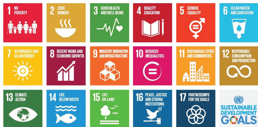
Fig. 1 Sustainable Development Goals (www.un.org)

Furthermore, two Sustainable Development Goals are critical and fundamental to tackle the key challenges of sustainable development in cities, i.e. the concentration of human activities